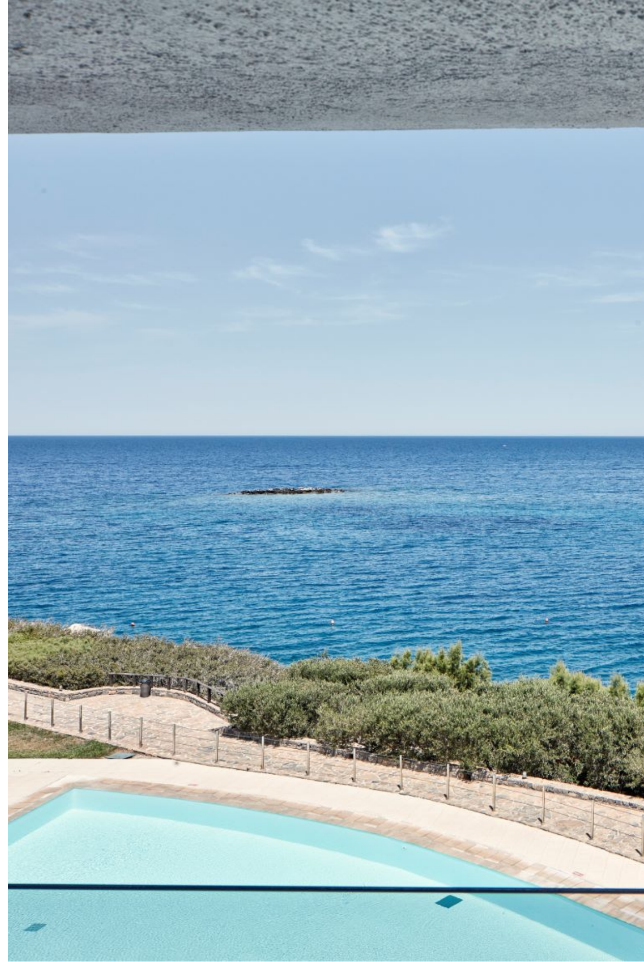
Upper Deck Seaview room Upper Deck Ocean View room