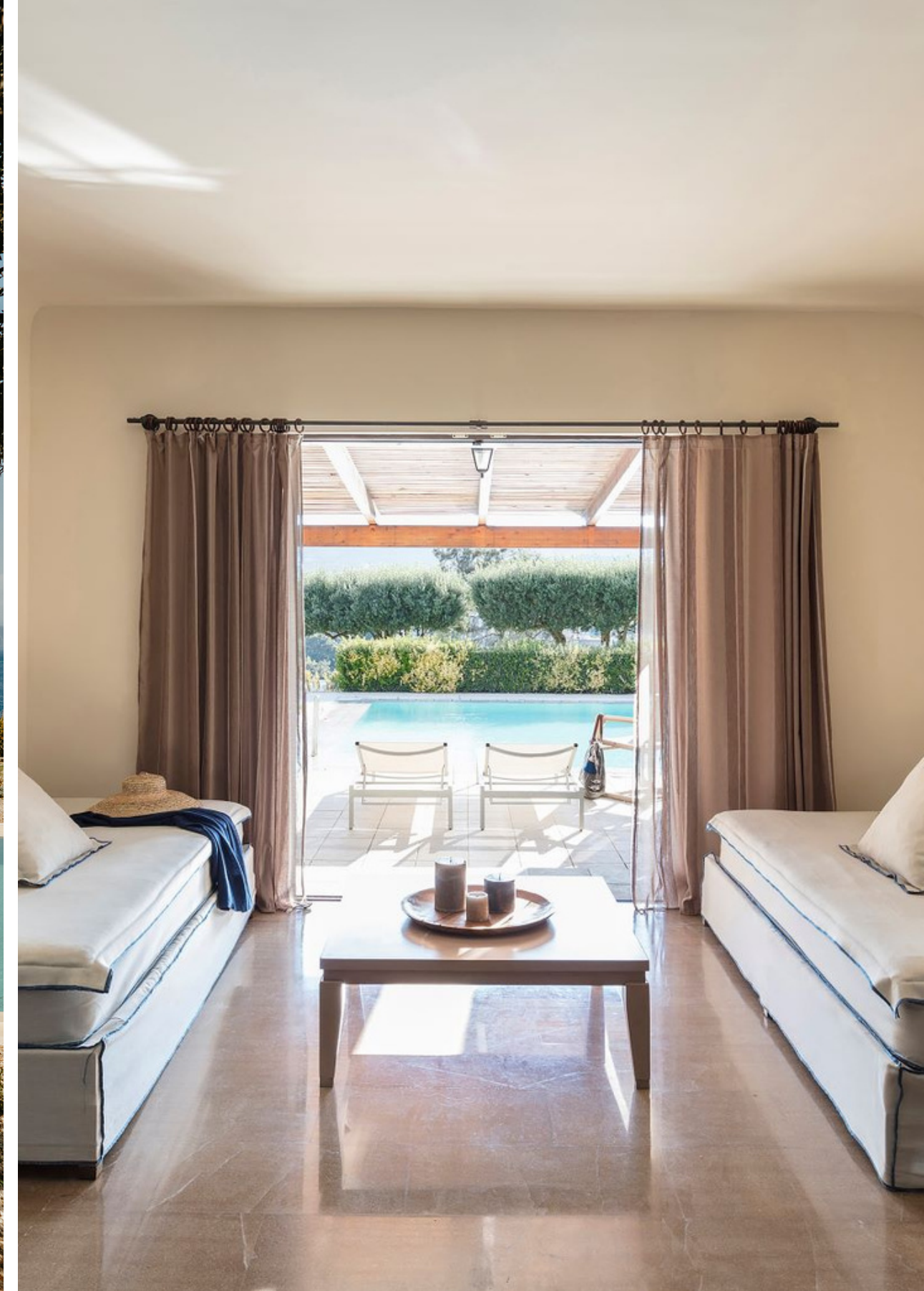
Junior suite sharing pool ocean view Junior suite private pool Waterfall suite with private pool