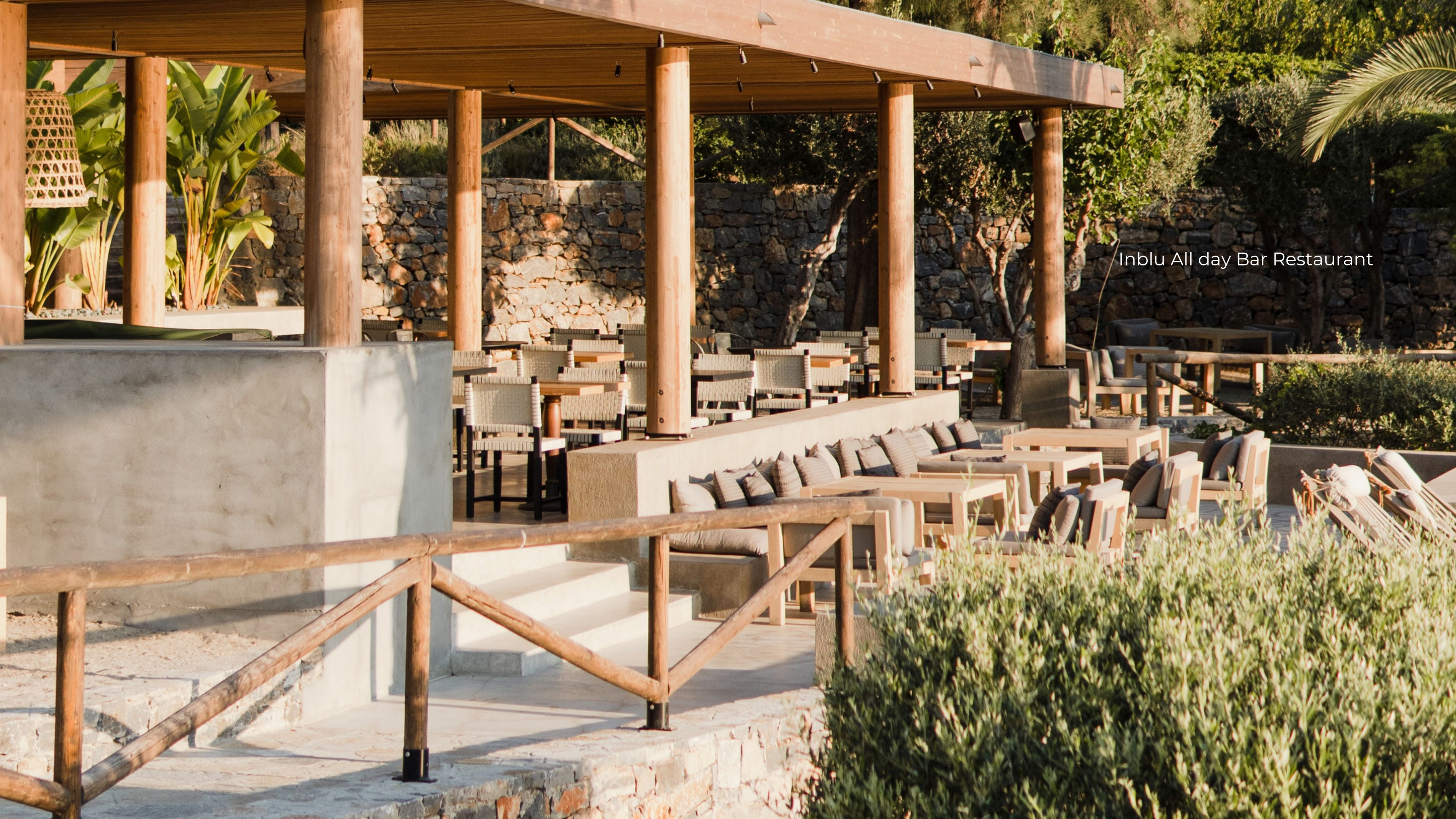
Inblu All day Bar Restaurant