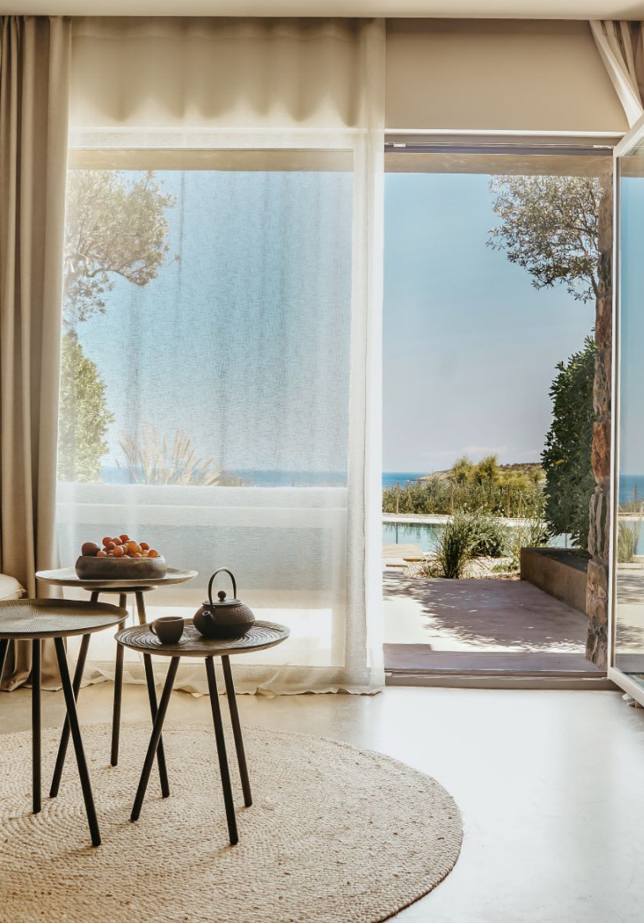
Junior Suite sea view lower deck One bedroom suite upper deck sea view