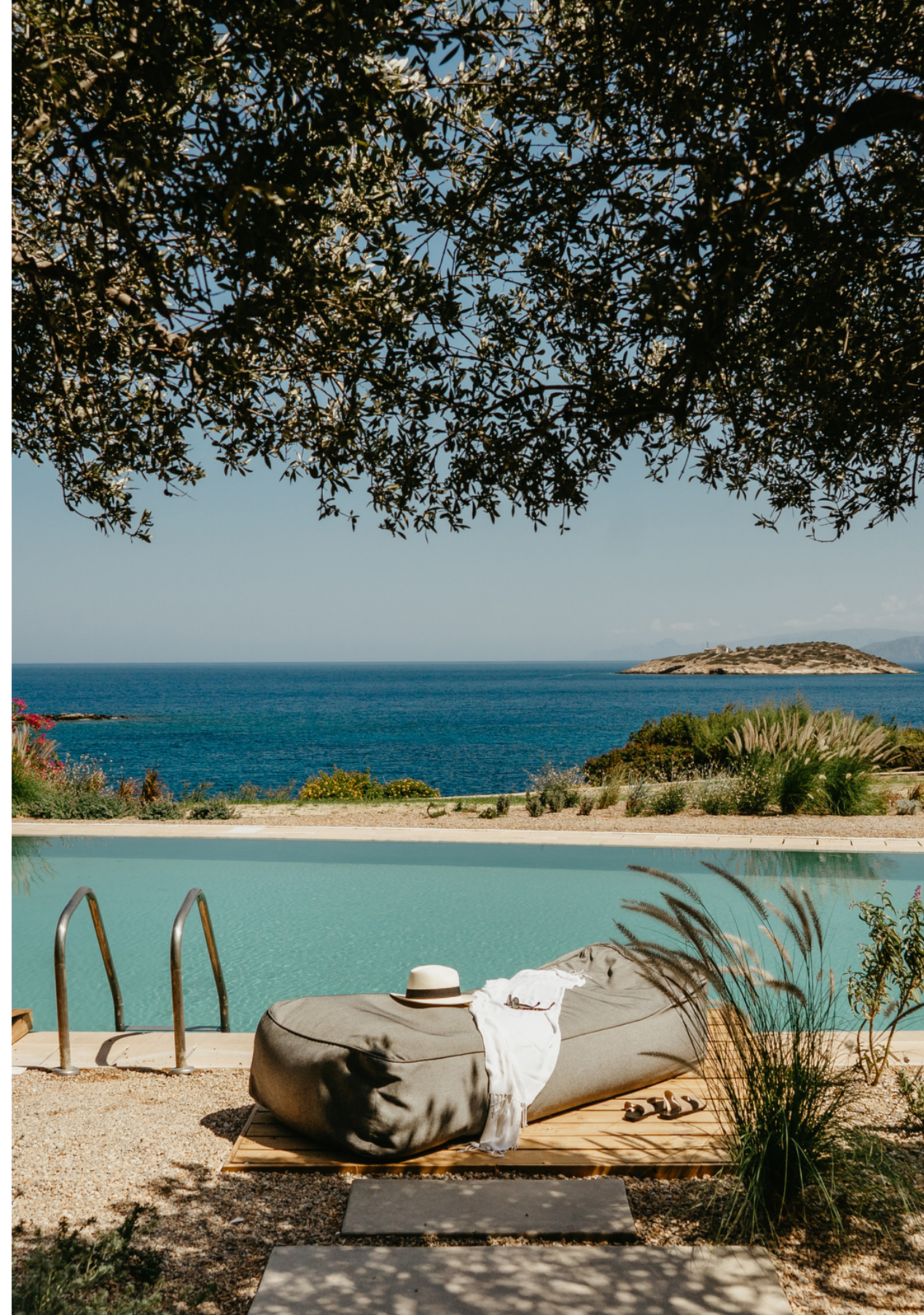
Ocean view bungalow One bedroom infinity blue suite