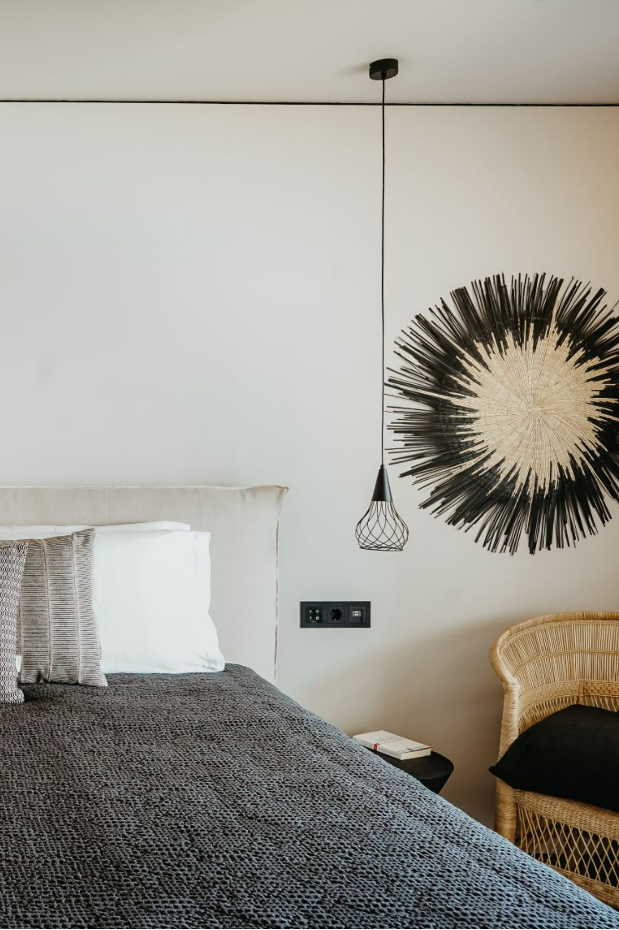
Infinity Blue room Sunset Sea view room